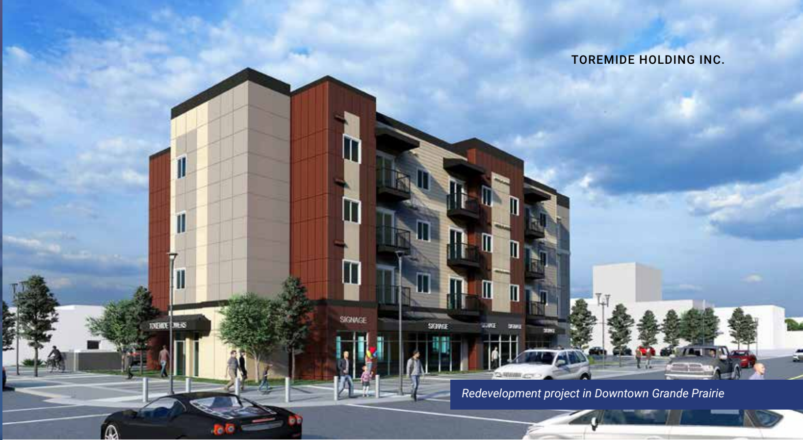
Redevelopment project in Downtown Grande Prairie

Successful cities around the world have proven to have vibrant downtown cores and Grande Prairie will be no different. We are looking forward to the future of our downtown and are very excited to be a part of it.