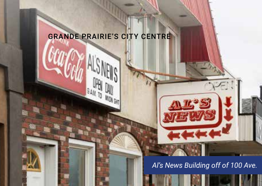
GRANDE PRAIRIE'S CITY CENTRE