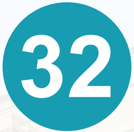
Median Age Of Grande Prairie