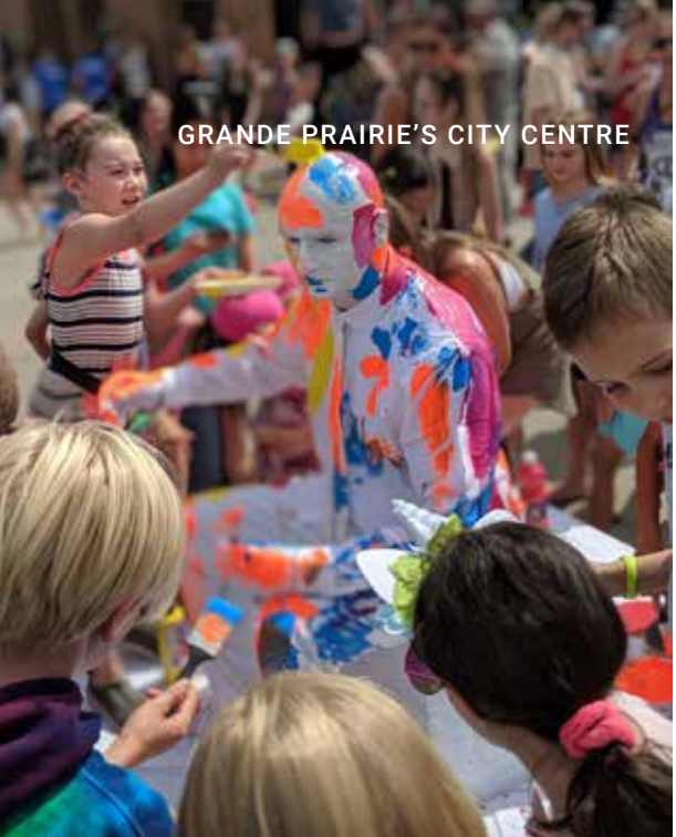
GRANDE PRAIRIE'S CITY CENTRE