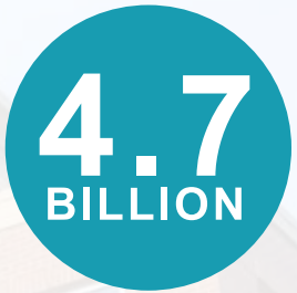
Estimated Spending Catchment