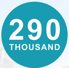
Population of Grande Prairie's Trade Area